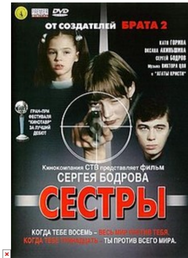
Sergei Bodrov, Jr., Sisters , 2001

Another interesting example of the Daughterland discourse in contemporary Russian popular culture is the latest cover of Viktor Tsoy's famous song Cuckoo/Kukushka from 1990, performed by a 12-years old Dasha Volosevich (2015). Earlier covers of this song were performed also by young female singers: Zemfira made her cover in 2000, and Polina Gagarina in 2015. Gagarina's version of Cuckoo was a soundtrack for the blockbuster «Battle of Sevastopol» (2015), which tells the story of a Soviet maiden who turns out to be a natural-born sniper. Here we see a reference to Bodrov's Sisters — not only because both girls are snipers, but also because Viktor Tsoy's Cuckoo was the Sisters ' soundtrack. «Battle of Sevastopol» demonstrated the commercial potential of the idea of Russia as a maiden warrior.