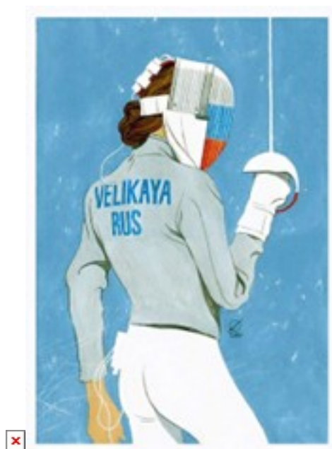
Doping-Pong, Great [Velikaya], 2015

The image of Daughterland in neoconservative discourse is also embodied in Russian sports beauties. Sports and military/political victories have been closely connected since Soviet times, but only in 2014 did this connection re-emerge full blown when Russia's Sochi Olympics victories coincided with the annexation of Crimea, and then in 2016 again due to the ban of some of Russian sportsmen, including Elena Isinbaeva for the Rio Olympic games. One can also point to symbolic images of figure skater Yulia Lipnitskaya and fencer Sofiya Velikaya that had Beliaev-Gintovt and Sankt-Petersburg art group Doping-Pong attributed their work to. For example, the artists of Doping-Pong in their work «Velikaya» employ a word play with the last name of the fencer (Velikaya translates as Great) and abbreviation Rus that all the sportsmen had on their uniform during the games. The result is a fresh, modern and unexpected interpretation of «Velikaya Rus translates as Ruthenia magna».