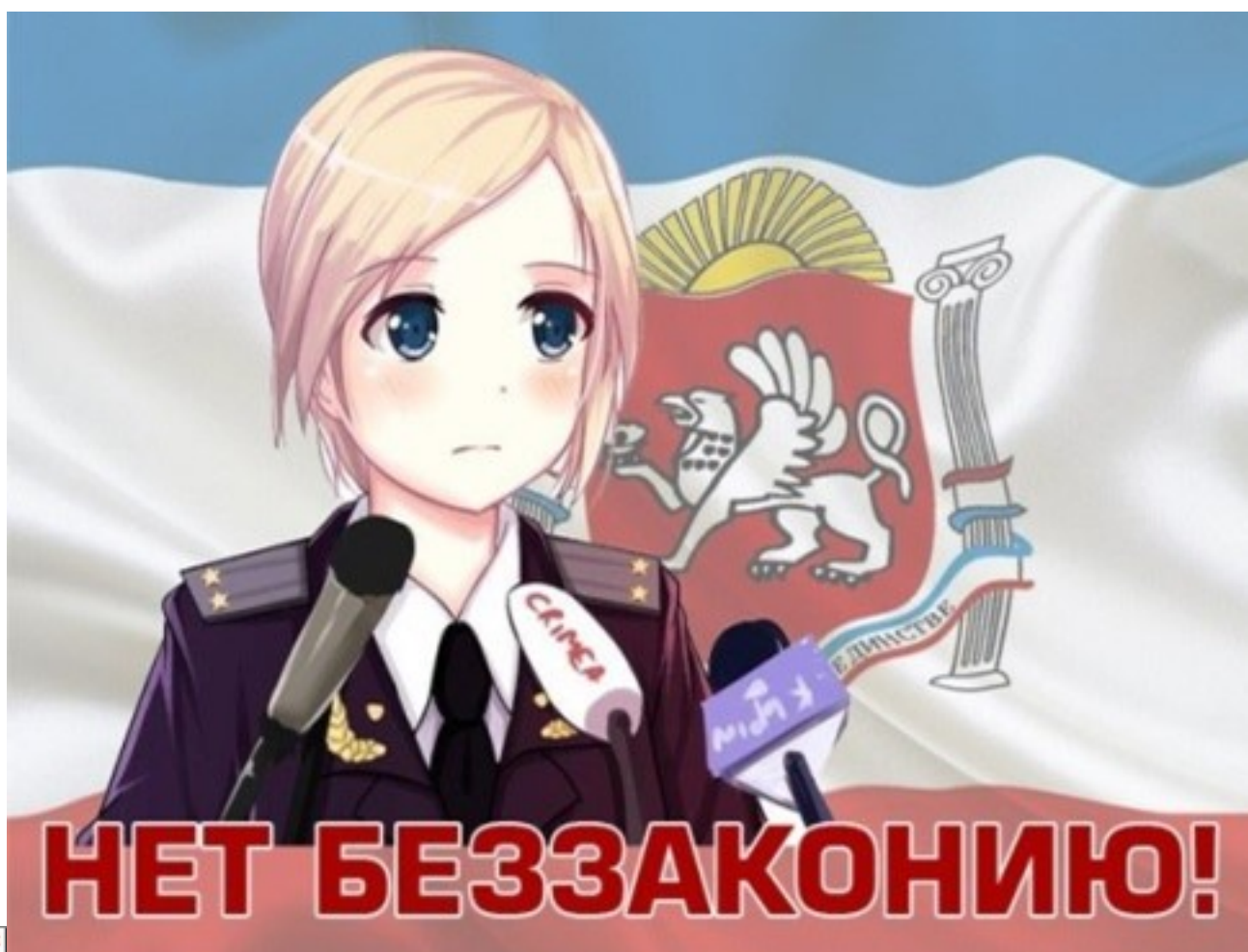
Natalia Poklonskaia as Nyash-Protectress, a shield against Anomia [bezzakonie]

A recent case which demonstrated the topicality of Daughterland discourse for official propaganda and mass culture was Natalia Poklonskaya, the Russian installed Prosecutor General of Crimea, who became a symbol of the Russian Spring. In the famous video clip «Nyash-Myash» by Enjoykin from March 2014 (26 million views on YouTube), she became a «cute» superhero in military uniform. Segments of the video shot in anime style presented the 34-year-old Poklonskaya as a girl with a sword, fighting metaphysical evil.